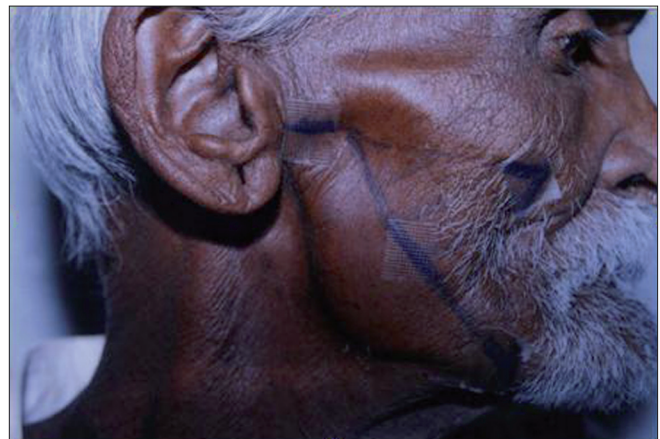
Figure 1: Radiation-induced alopecia

It was not long before that the physiological effects of radiation were noticed. In April 1896, Daniel described epilation and a serious skin reaction after prolonged exposures; other reports soon followed, the realization that the large doses of X-rays produced harmful effects on the skin suggested that beneficial effects on skin diseases might be obtained with lower doses. In 1896, Freund of Vienna observed epilation by X-ray therapy of a large hairy nevus and followed this by treating various inflammatory diseases,